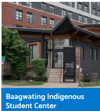
Baagwating Indigenous Student Center

Houses the Center for Evaluation and Survey Research, the Centre on Hate, Bias, and Extremism, and the Digital Culture and Media Lab (Decimal Lab) in addition to academic spaces.